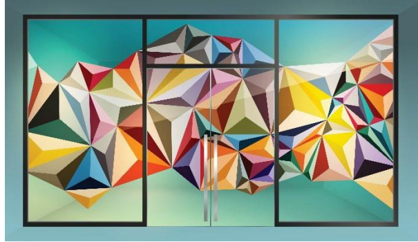
Vacant shop window artwork/skins