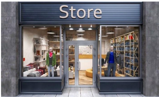
Updated store signage