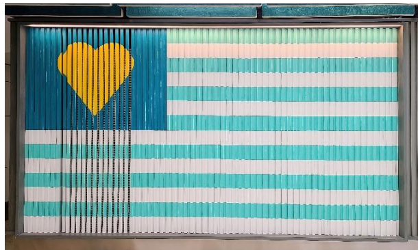
Updated and decorative/mural roller shutters