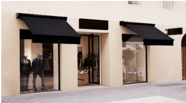
Painting and façade upgrade/refresh