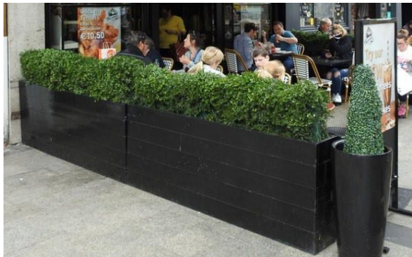
Decorative planter boxes in approved footpath trading areas