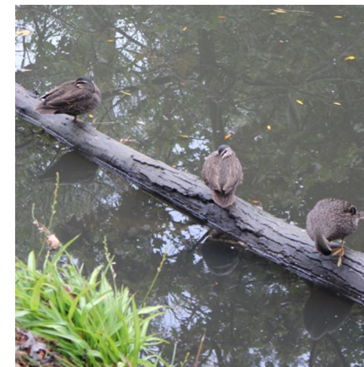
Ducks at Glen Iris wetlands