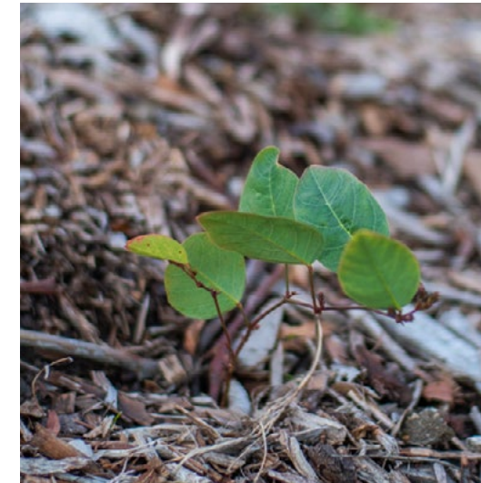
Hardenbergia seedling at Urban Forest