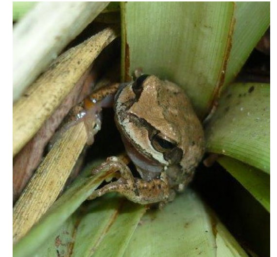
Southern Brown Frog at Glen Iris Wetlands