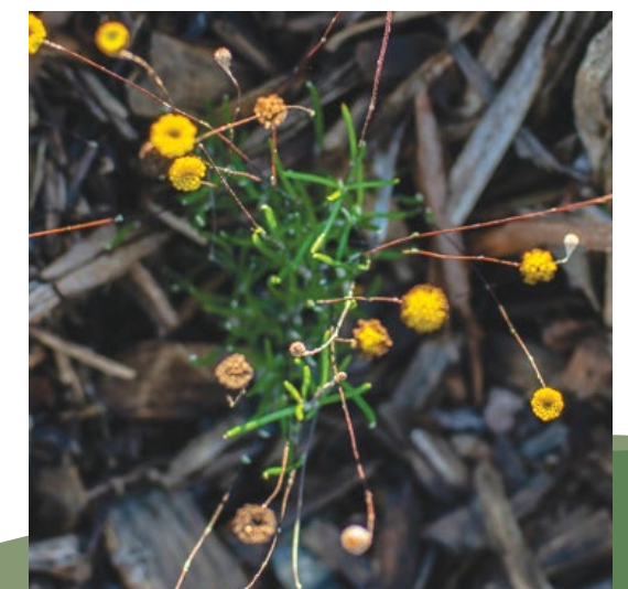
Wiry Daisy at Darling Park