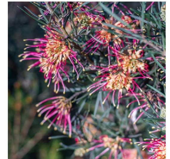
Grevillea at Toorong Park