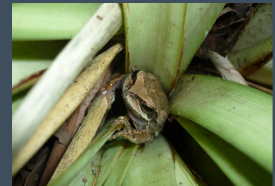
Southern Brown Frog

Children can look for animals and insects, search for tracks and describe the different plants they can see. They can discuss how we identify different animals (e.g. birds have wings) and what different animals might need to survive. Children can expand on this and create temporary, animal specific hotels based on their needs.