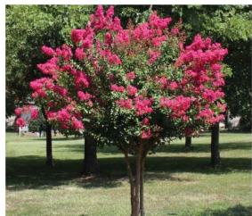
NEW STREET TREE Lagerstroemia indica (summer)