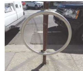
CYCLE HOOP Pole mounted