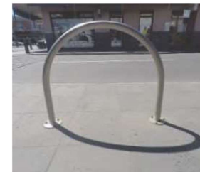
CYCLE HOOP In-ground