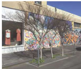
EXISTING STREET TREES Lagerstroemia indica (winter)