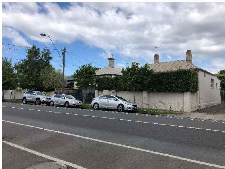
Figures 1 & 2. Toorong Road, Malvern (GJM Heritage, November 2020).