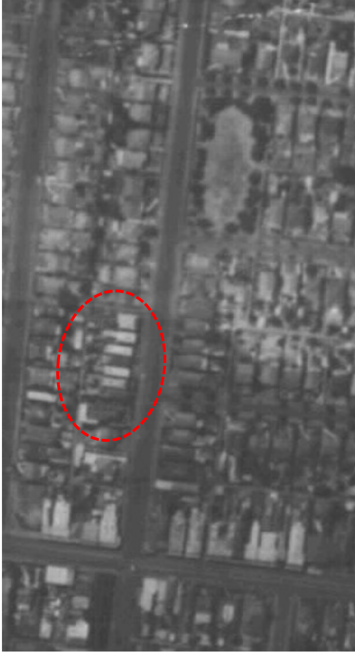
Figure 5. Detail of 1945 aerial showing development along Toorong Road. The approximate outline of the houses at 105-119 Toorong Road is indicated