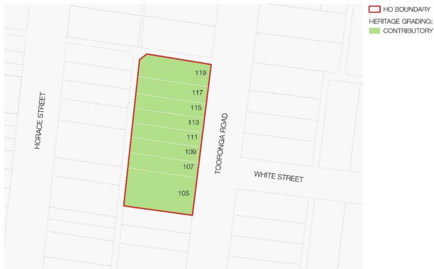
Figure 6. Recommended Extent of Heritage Overlay and proposed gradings

To the extent of the property boundaries, as shown in Figure 6 below.