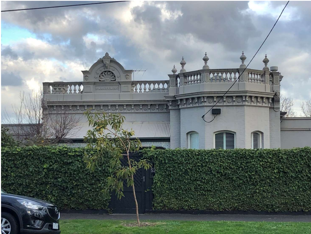
Figure 1. 52 Stanhope Street, Malvern (GJM Heritage, July 2020).

Darjeeling, 52 Stanhope Street, Malvern (HO340)