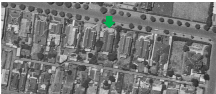
Figure 4. Aerial photograph showing houses at 44-54 Stanhope Street, Malvern, 1945. Green arrow indicates no. 52