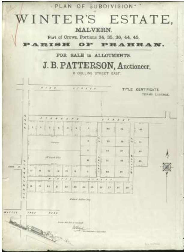
Figure 2. Winter's Estate subdivision, showing the original subdivision of the south side of Stanhope Street, 1881.