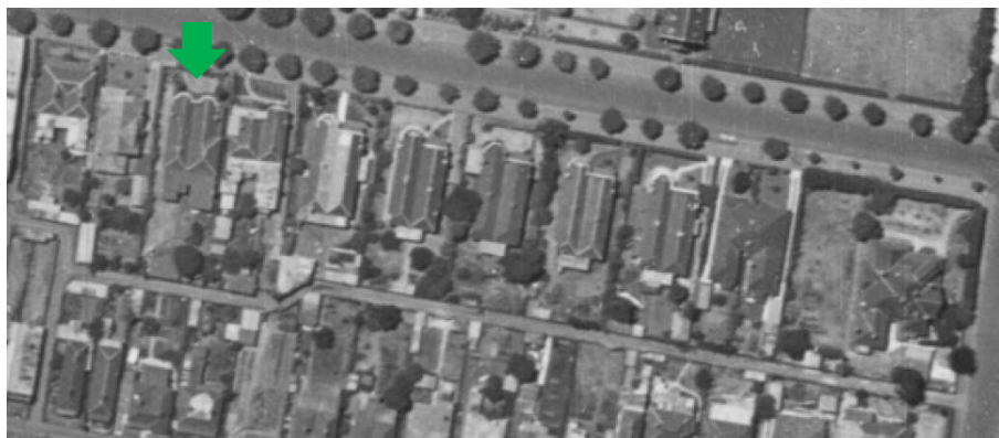
Figure 4. Aerial photograph showing houses at 44-54 Stanhope Street, Malvern, 1945. Green arrow indicates no. 44