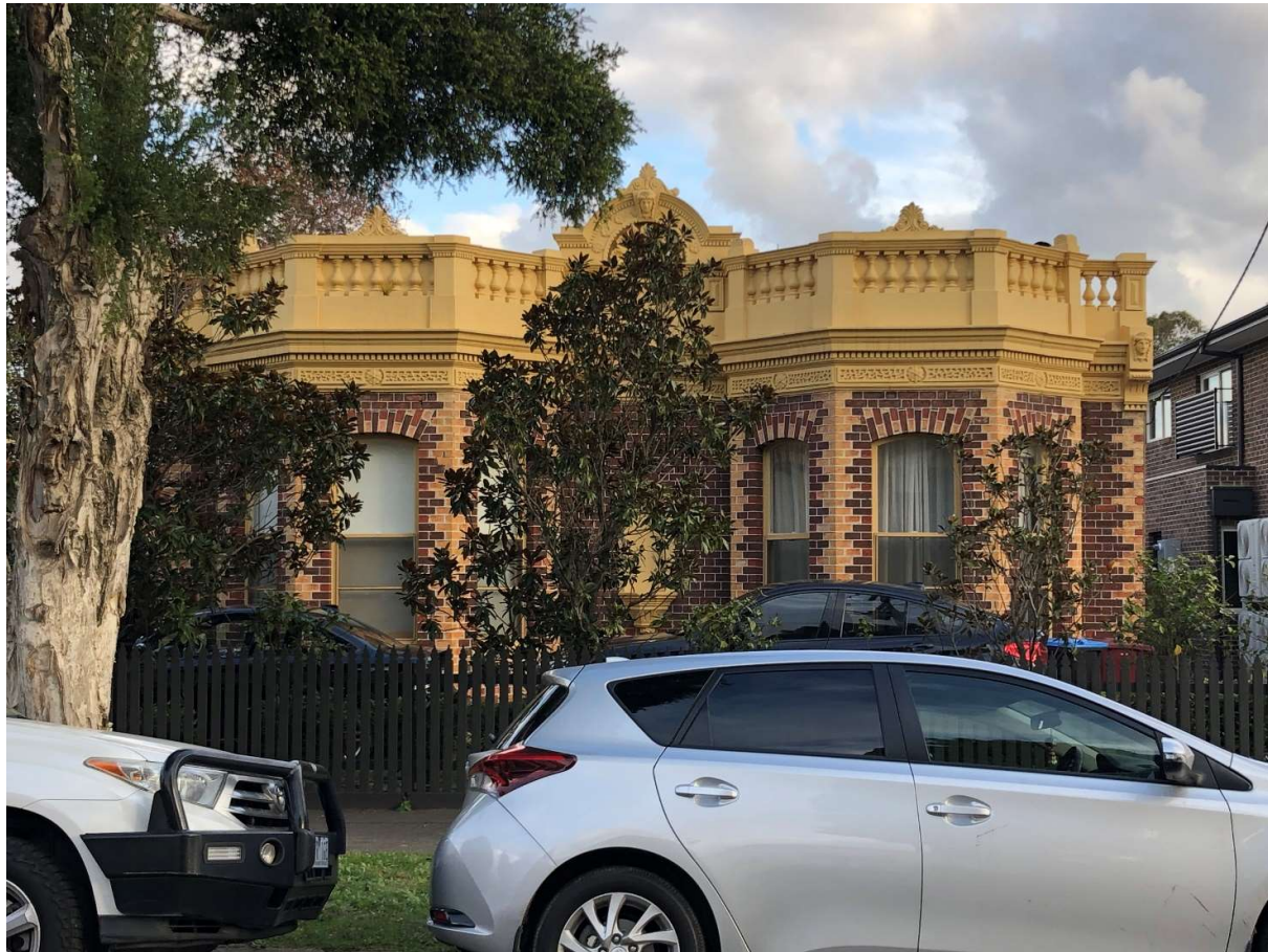
Figure 1. 44 Stanhope Street, Malvern (GJM Heritage, July 2020).