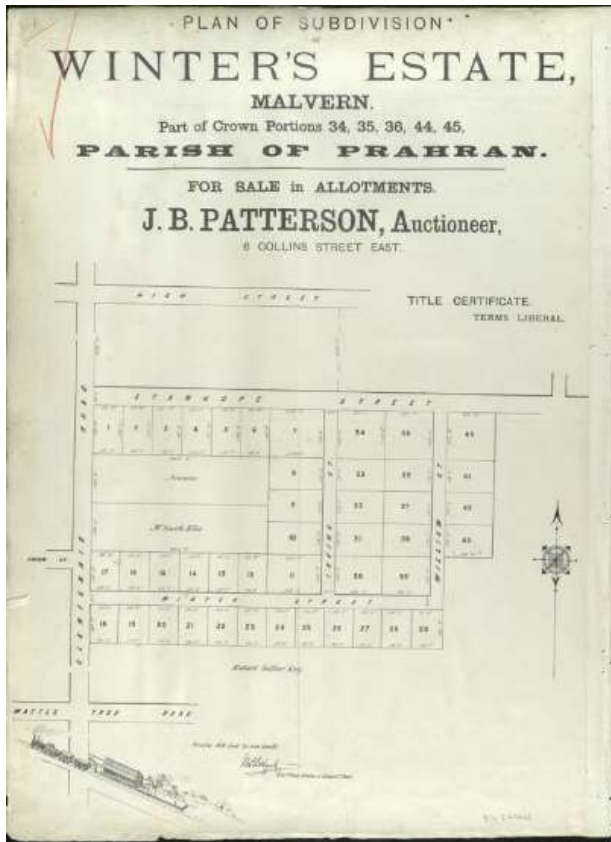
Figure 2. Winter's Estate subdivision, showing the original subdivision of the south side of Stanhope Street, 1881.