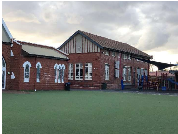
Figures 1-4. (R-L, top to bottom) St Joseph’s Church, Presbytery, Parish Hall and School (GJM Heritage, July 2020).