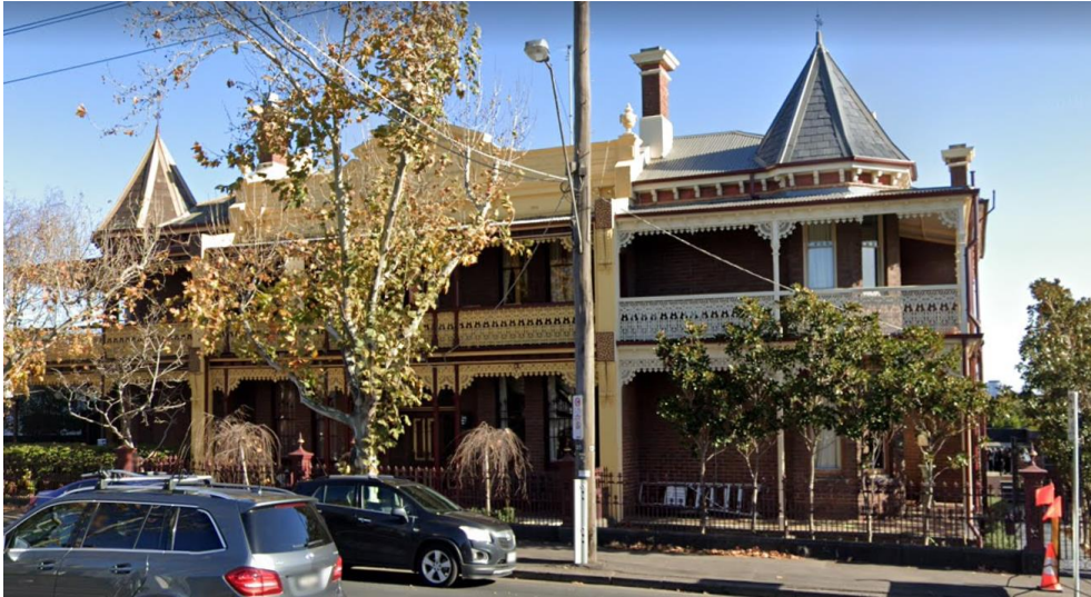
Figure 12. 131-135 Williams Road Prahran.

HO155, 131-135 Williams Road Prahran – This substantial row of three double-storey bichrome brick terraces are individually significant within HO155. Designed as a pair of two end terraces with distinctive corner turret bays, the central third terrace is recessed and distinguished by an elaborate Italianate parapet and pediment. The terrace group displays an unusual combination of Italianate detailing combined with design features of the Australian Queen Anne style that was popular at the turn of the twentieth century.