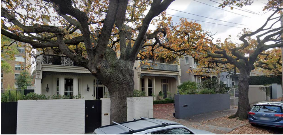
Figure 10. 3-9 Kensington Road, South Yarra.

HO561, Terrace Row, 3-9 Kensington Road, South Yarra – a row of four freestanding brick terrace houses built in 1888 in the Italianate style. Originally constructed in bichrome face brick, No. 5 is now overpainted, and Nos. 3,7 and 9 rendered. Each terrace features a hipped slate roof with bracketed eaves, typical Italianate corniced chimneys, two-storey verandahs with cast iron frieze, brackets and balustrades