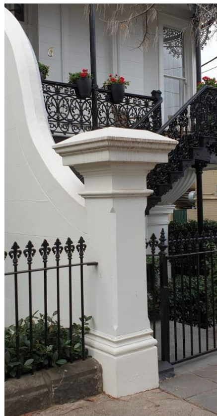
Figure 4. Italianate fence pier and palisade fence detail. Note: serpentine garden dividing wall.

Prominently sited on the corner of Station Street, the terrace group is distinguished by the façade treatment of no.6. This terrace rises three storeys above street level and is distinctive for its corner oriel bay window and curved cast iron verandah with balustraded cast iron staircase. With the main floor of the terrace sitting above a full basement level, its position on the corner of two streets provides an unusually picturesque three-dimensional quality to the composition of the terrace group.