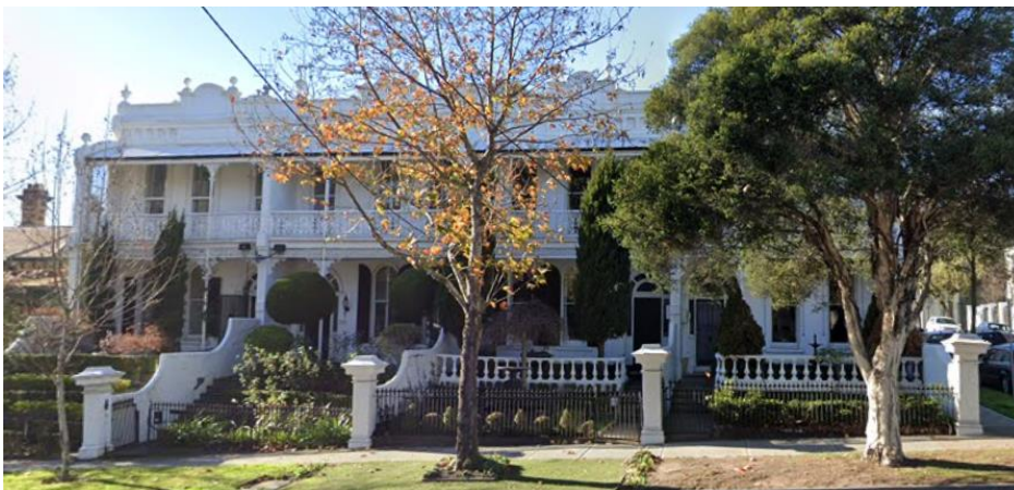
Figure 9. 286-292 Williams Road, Toorak.

HO155, 286-292 Williams Road, Toorak – this row of four attached two-storey terrace houses are individually significant within HO155. Designed in the Italianate style they display key characteristics of the style including a parapet with pediments and decorative urns that conceal a hipped roof, bracketed eaves, round arched window and door openings, a two-storey cast iron verandah across the front between dividing party walls and a palisade cast iron fence with Italianate piers and serpentine garden dividing walls