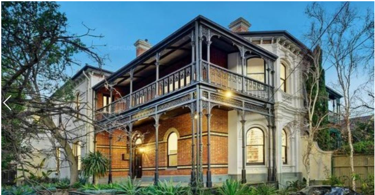
Figure 11. 14 & 16 William Street, South Yarra.

HO566, 14 & 16 William Street, South Yarra - The semi-detached pair are massed to look like a single mansion, sharing a very wide two-storey canted bay at the centre of the front facade, which is flanked by return verandahs with cast-iron detail. The projecting bay is finished with cast and run cement render detail, as are the rear wings which sit behind the return verandahs. The walls beneath the verandah, however, are of polychrome brick.