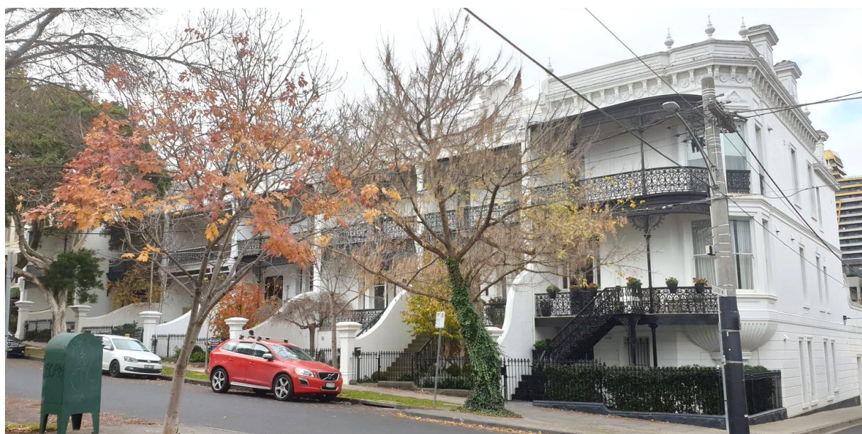
Figure 1. 6-18 Avoca Street, South Yarra.