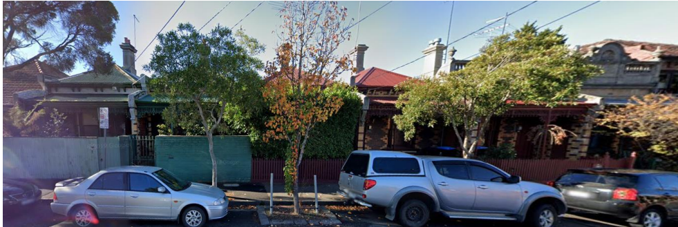
Figure 14. 64-74 Upton Road, Windsor.

HO584, 64-74 Upton Road, Windsor – this terrace row of six single-storey attached terrace house was built in 1890 for a single owner as rental properties. All six of the houses have a separate roof form, and the walls are of tuckpointed Hawthorn brick with cream brick dressings in lively quoining and diaper patterns, as well as red bricks to the blind arches of the verandah wing walls. All have the same distinctive chimney form: rendered with a cornice, ornamented by vermiculated panels on each face. Overall, they can be described as Italianate in style with decorative iron verandahs set between dividing party walls.