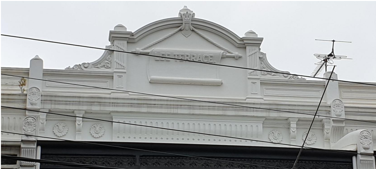
Figure 6. Pediment at 12 Avoca Street, South Yarra featuring a moulded banner with the words 'Lee Terrace' embossed.

Each of the five terraces of the central recessed section (nos. 8-16) are set between projecting masonry party walls. Each party wall features narrow vertical end panels with fluted details, decorative scrolls and embossed floriated motifs. At roof level, each terrace has a centrally placed semi-circular pediment between engaged columns set within a simple panelled parapet, with the exception of no. 12 where the pediment is wider and curved and features a moulded banner with the words 'Lee Terrace' embossed. The cornice line above the verandah roof features sophisticated curved fluted detailing which stops below each pediment. This treatment is reversed for the central terrace (no.12) where the cornice line is fluted below the pediment with masonry eave brackets and rosettes either side.