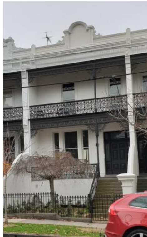
Figure 8. Façade detail at 10 Avoca Street South Yarra showing typical detailing seen at Nos. 8, 10, 14 & 16.

Whilst largely similar to the five central recessed terraces, the northern most projecting end terrace (no. 18) displays subtle differences in its detailing. Whilst the parapet and pediment details are identical to nos.8, 10, 14 and 16 the cornice line is bracketed with rosettes in an identical fashion to no. 6 and no. 12. At the ground floor level the openings are identical to the five recessed terraces, whilst at the first floor level a single vertically proportioned window opening sits above the entry door below with a tripartite window replacing the single window found in the other terraces.