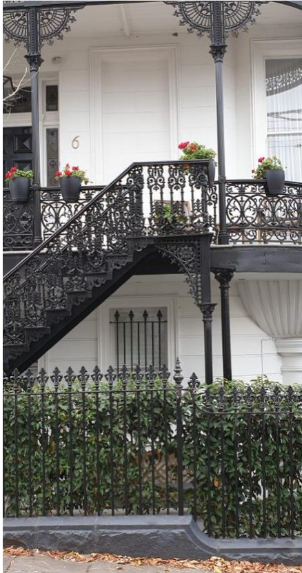
Figure 5. Basement and ground floor façade detail at 6 Avoca Street, South Yarra showing cast iron stair and corner Oriel window

At roof level, a panelled parapet set with urns at each corner sits above an ornate cornice line with masonry brackets and rosettes. Three substantial Italianate chimneys rise above the cornice line along Station Street and are set between decorative scroll brackets. The terrace boundary wall along Station Street is smooth rendered and broken up by moulded cornice lines demarcating each floor level. At the top two levels the rendered finish to the wall is ruled with lines to imitate ashlar blockwork whilst at the ground level the walls are rusticated. The wall is punctuated by a number of vertically proportioned openings with masonry architraves and rendered projecting sills. Windows are typically timber framed double hung sash windows. Towards the rear of the terrace detailing is simpler with the principal cornice line unbracketed and no architraves around the windows. The single storey brick boundary wall towards the rear of the building including the garage doors are not original.