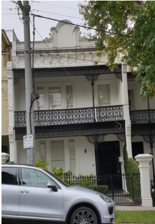
Figure 7. Façade detail at 18 Avoca Street, Note: tripartite window at the upper level South Yarra.