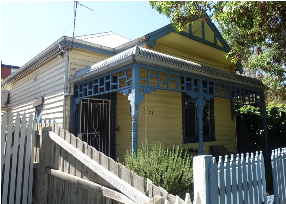
Figure 7. 21 Packington Place. Note Japanese-influenced verandah frieze.

The seven Packington Place houses are differentiated from the others in the precinct by their timber construction and the use of a Japanese-influenced timber frieze pattern which is not seen elsewhere in the precinct. These houses are otherwise nearly identical in design to McNaughton's two brick semi-detached dwellings at 87 and 89 Chomley Street.