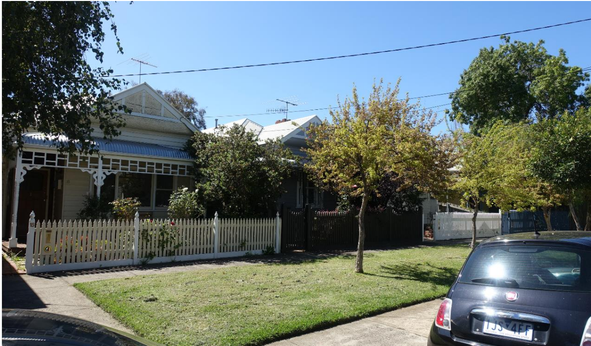
Figure 3. North side of Packington Place (Nos. 15-21) showing the wide nature strip to the enlarged cul-de-sac.

As set out in the history, subdivision of the precinct took place in 1910 and 1912, with all houses and the corner store completed by 1914. All but one of these buildings survive, apart from 73 Chomley Street on the north corner of Closeburn Avenue.