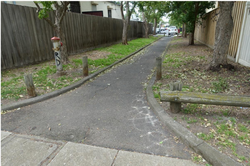
Figure 2. Pedestrian link between Chomley Street and Packington Place (85 Chomley Street), looking west.

HO386 Chomley Street Precinct, as extended in 2020, comprises the western side of Chomley Street from just north of Dandenong Road to a point slightly north of Taylor Close (which is on the eastern side of the street), as well as properties on both sides of the east end of Packington Place which sit behind the northern end of the Chomley Street row. The two streets of the precinct are linked via a pedestrian walkway created as part of the development of the east end of Packington Place in 1912.