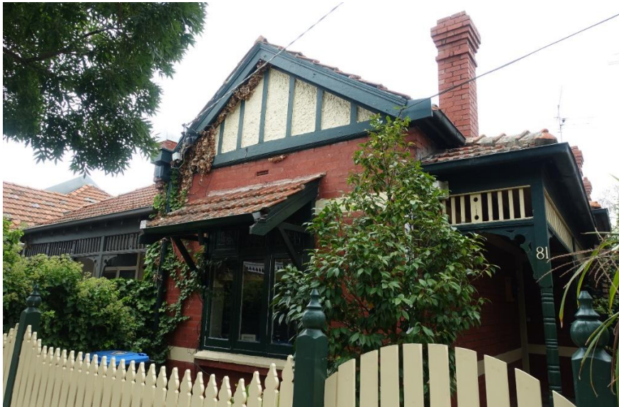
Figure 5. Semi-detached pair at 79/81 Chomley Street with extensive timber fretwork.

The streetscape is composed of dwellings that are modest in scale taking the form of ornamented villas or semi-detached pairs on small blocks. Residences are typically of brick frequently combining face brick with bands or other rendered devices to produce an understated domestic interpretation of the 'blood and bandages' style found more prominently in contemporary institutional buildings. However, it is the extensive use of timber for decorative elements that distinguishes and unifies the group, particularly 7-69 and 75-83 Chomley Street and the Packington Place houses. The dwellings illustrate the variety and invention of timber adornments available to the Edwardian designer, including verandah fretwork, ornamental brackets to broad eaves and strapping or other timber decoration to gable ends.