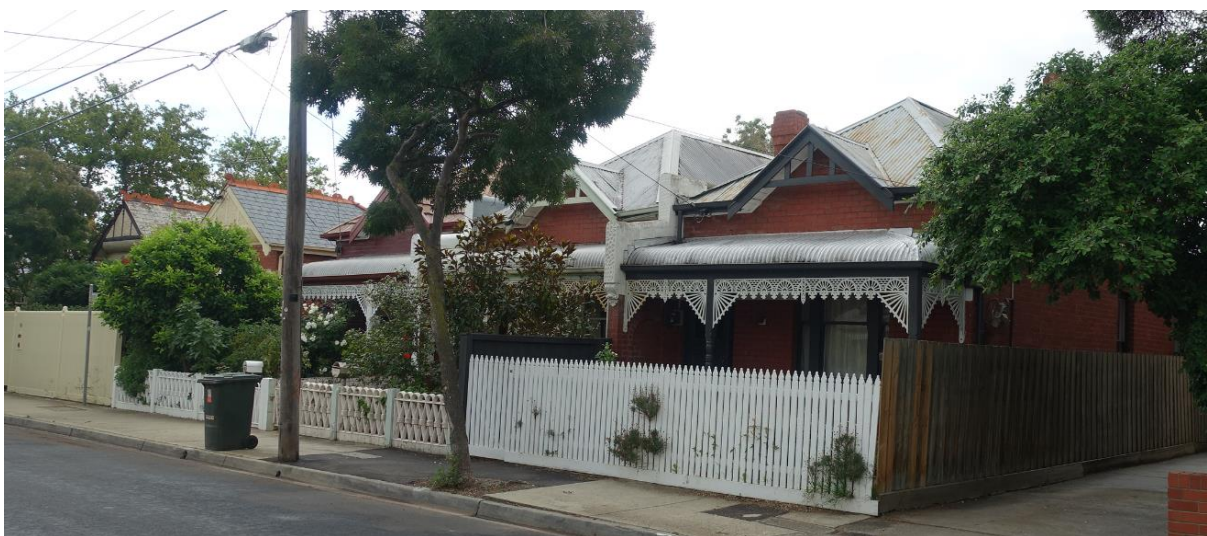
Figure 6. Houses at the north end of the precinct, 87-95 Chomley Street. Note the use of cast-iron verandah friezes.

The single-fronted houses and row of three attached dwellings at the north end of the precinct – 87-97 Chomley Street – are similar in form and detail to those to the south, except that they retain the use of cast-iron verandah friezes in flattened patterns typical of the 1910s.