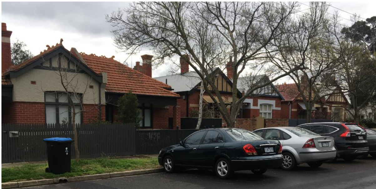
Figure 4. 19-29 Chomley Street. An asymmetrical semi-detached pair (19/21) is visible at left, while symmetrical semi-detached pairs (23/25 and 27/29) are seen at right.

This remarkably rapid development as well as the construction of groups of houses by a single developer, such as Alfred McNaughton, has led to highly consistent streetscapes in the precinct.