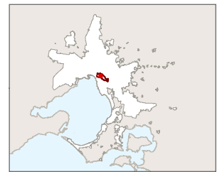
Part of Planning Scheme Map 5HO

Disclaimer This publication may be of assistance to you but the State of Victoria and its employees do not guarantee that the publication is without flaw of any kind or is wholly appropriate for your particular purposes and therefore disclaims all liability for any error, loss or other consequence which may arise from you relying on any information in this publication.