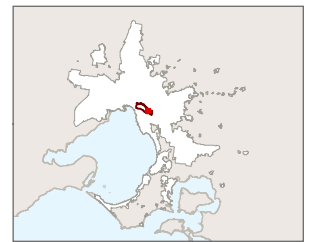
Part of Planning Scheme Maps 7NCO & 9NCO

Disclaimer This publication may be of assistance to you but the State of Victoria and its employees do not guarantee that the publication is without flaw of any kind or is wholly appropriate for your particular purposes and therefore disclaims all liability for any error, loss or other consequence which may arise from you relying on any information in this publication.