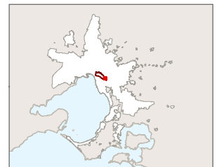
Part of Planning Scheme Map 10NCO