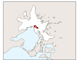
Part of Planning Scheme Map 5DDO

Disclaimer This publication may be of assistance to you but the State of Victoria and its employees do not guarantee that the publication is without flaw of any kind or is wholly appropriate for your particular purposes and therefore disclaims all liability for any error, loss or other consequence which may arise from you relying on any information in this publication.