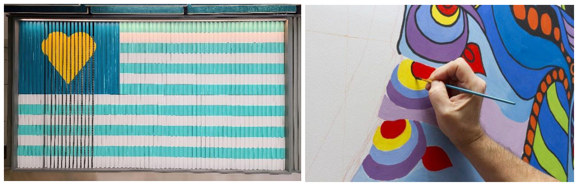
Updated and decorative/mural roller shutters