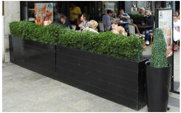
Decorative planter boxes in approved footpath trading areas