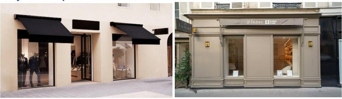
Painting and façade upgrade/refresh