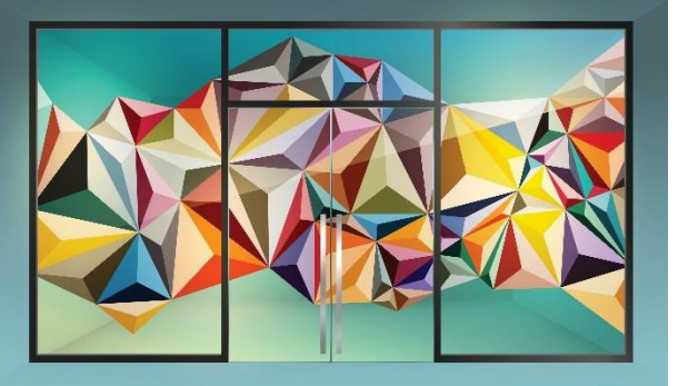
Vacant shop window artwork/skins