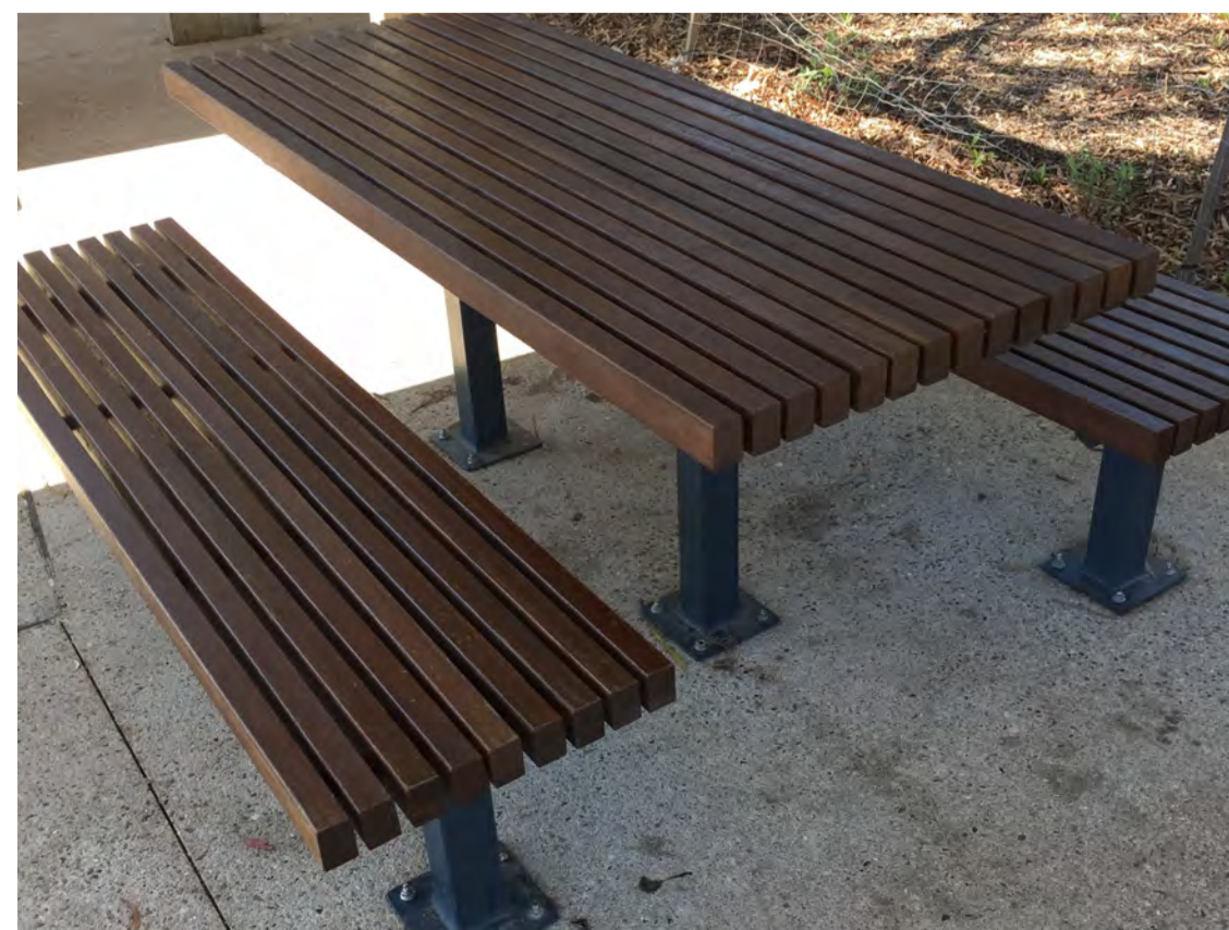
Timber picnic settings