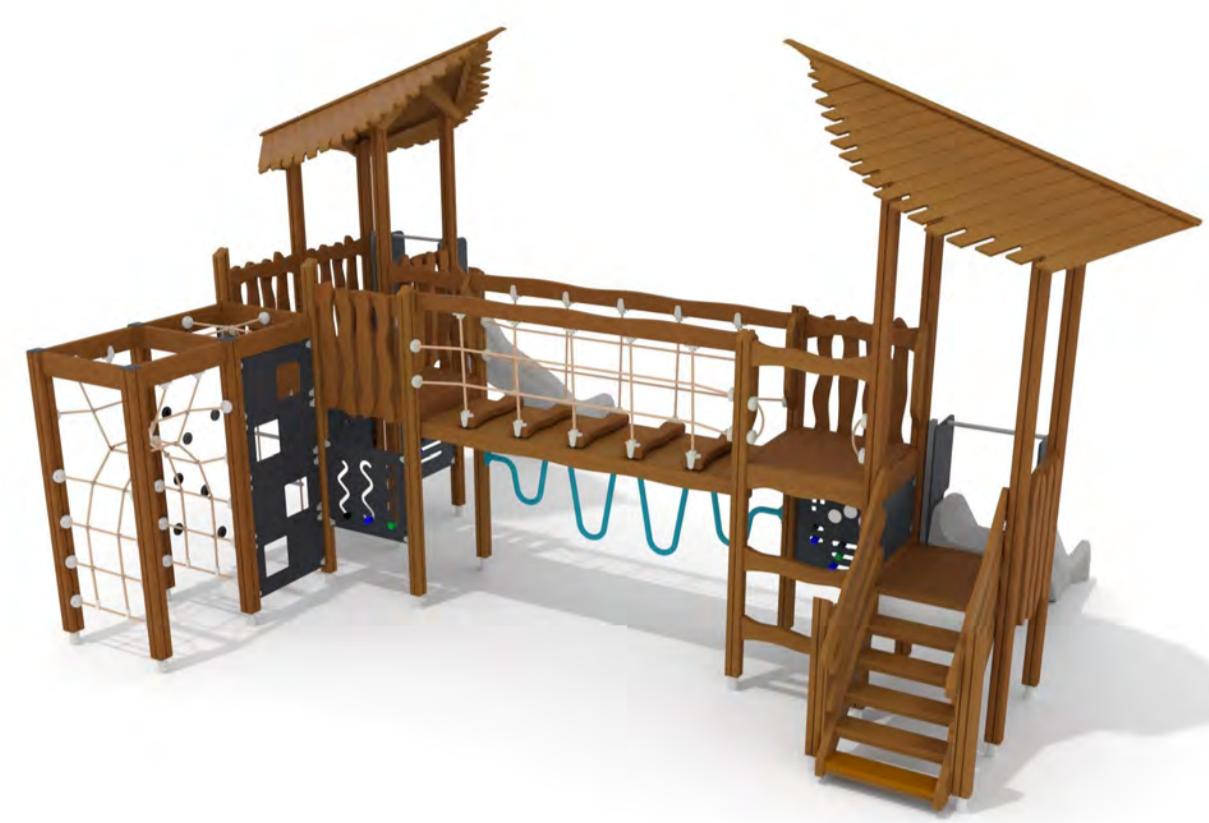
Play equipment aesthetic in-keeping with garden-theme