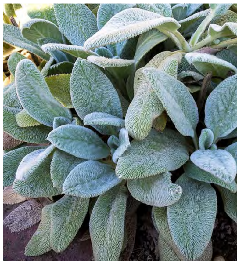
Planting for texture