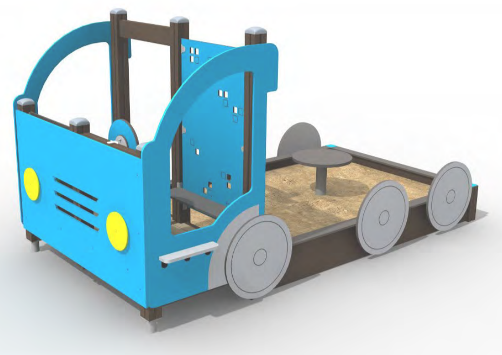
New vehicle to feature built-in play elements