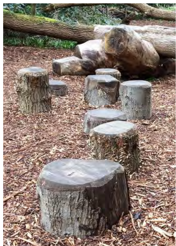
Timber log steppers