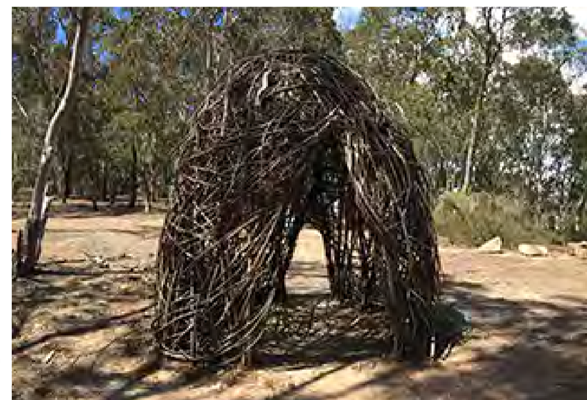
Woven cubby shelter amongst existing trees.