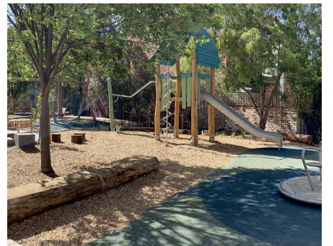
Planting for shade