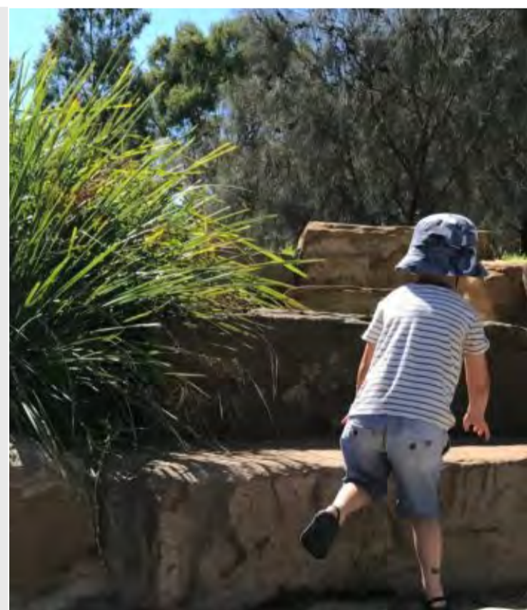
Stepped sandstone boulders