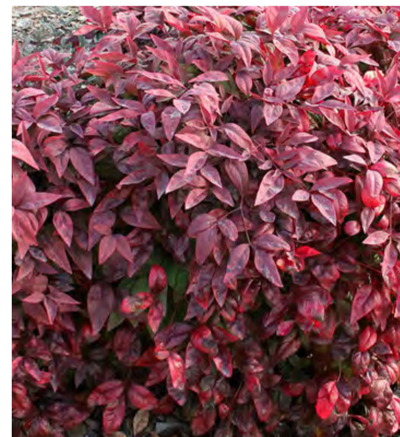
Planting for colour