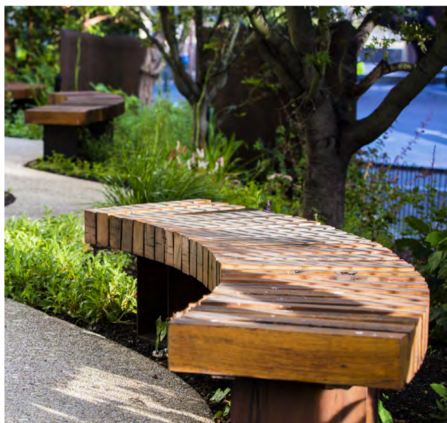
Curved timber seating