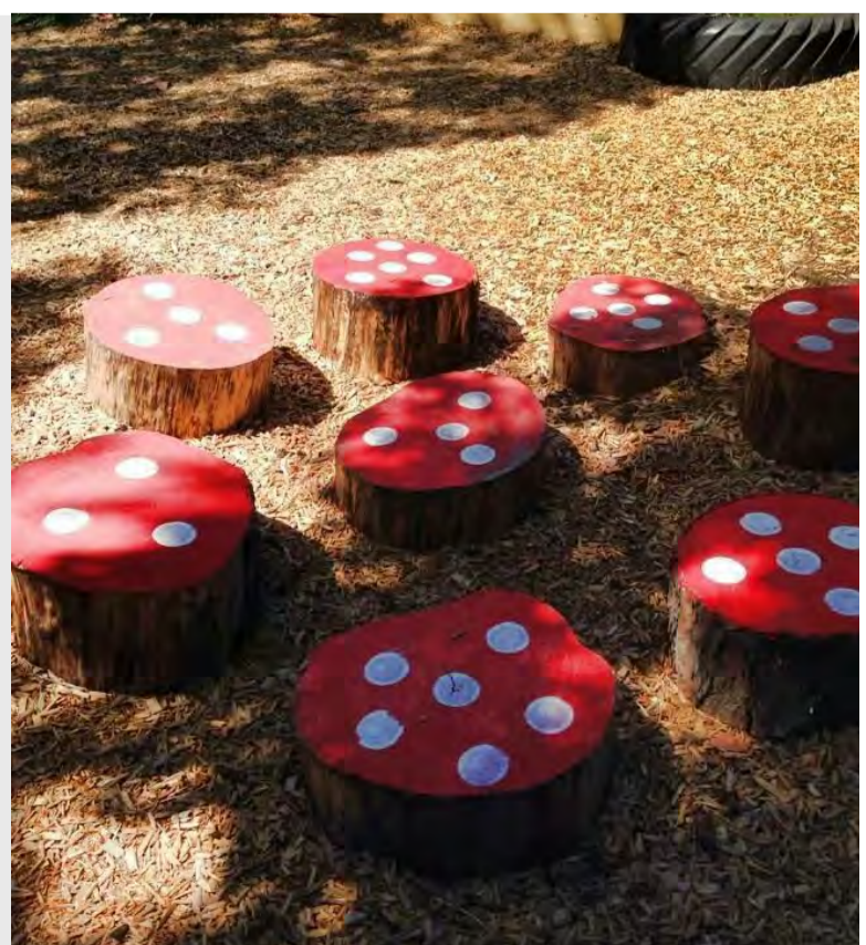
Informal childrens seating