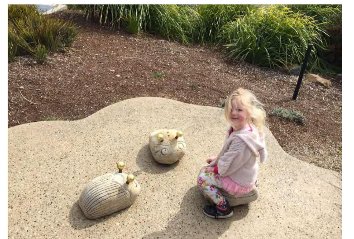
Sculptural play elements beneath established trees