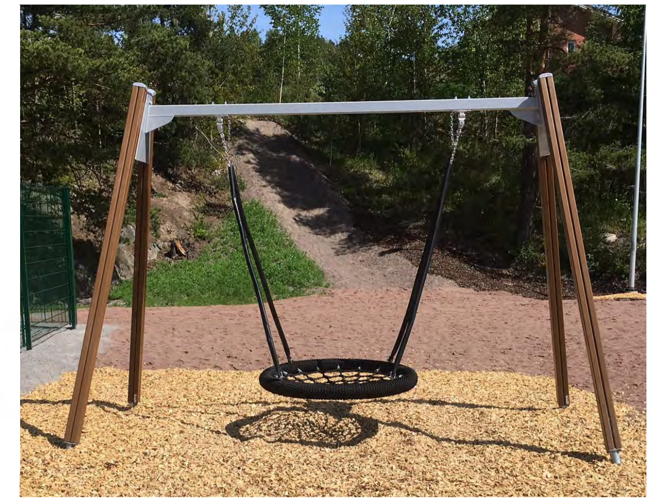
Accessible nest swing (to include rubber surfacing)