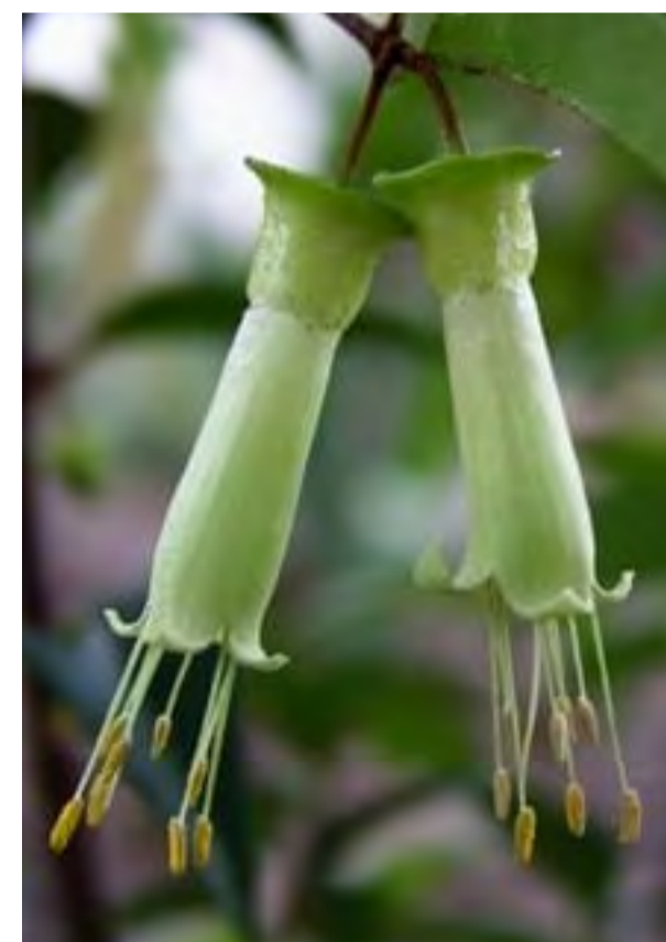
Planting for interest