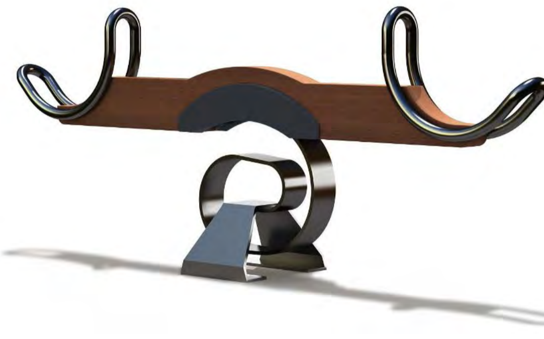
Double see-saw springer