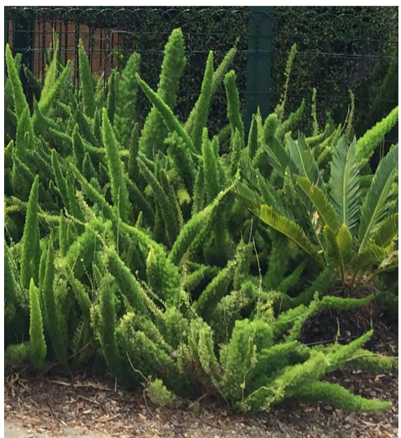
Mass planting for variety in form