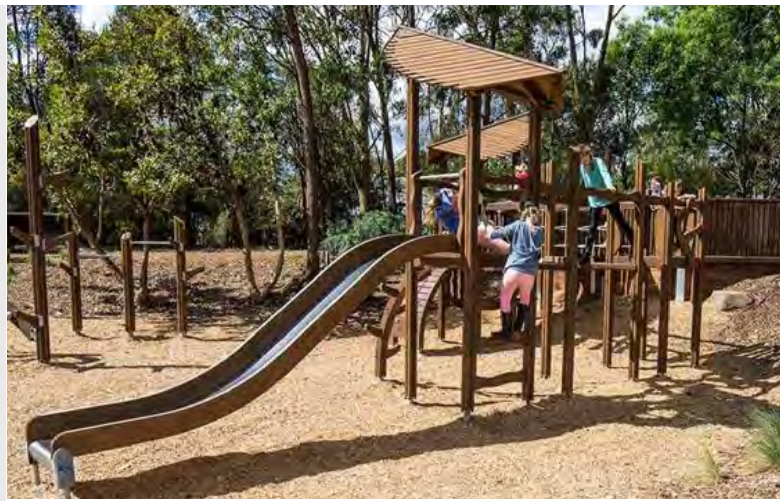
Combination unit including climbing options, slide and towers with roof