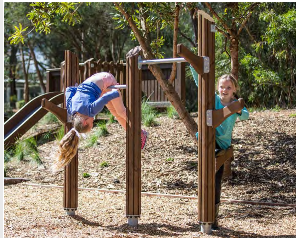
Social climbing play elements