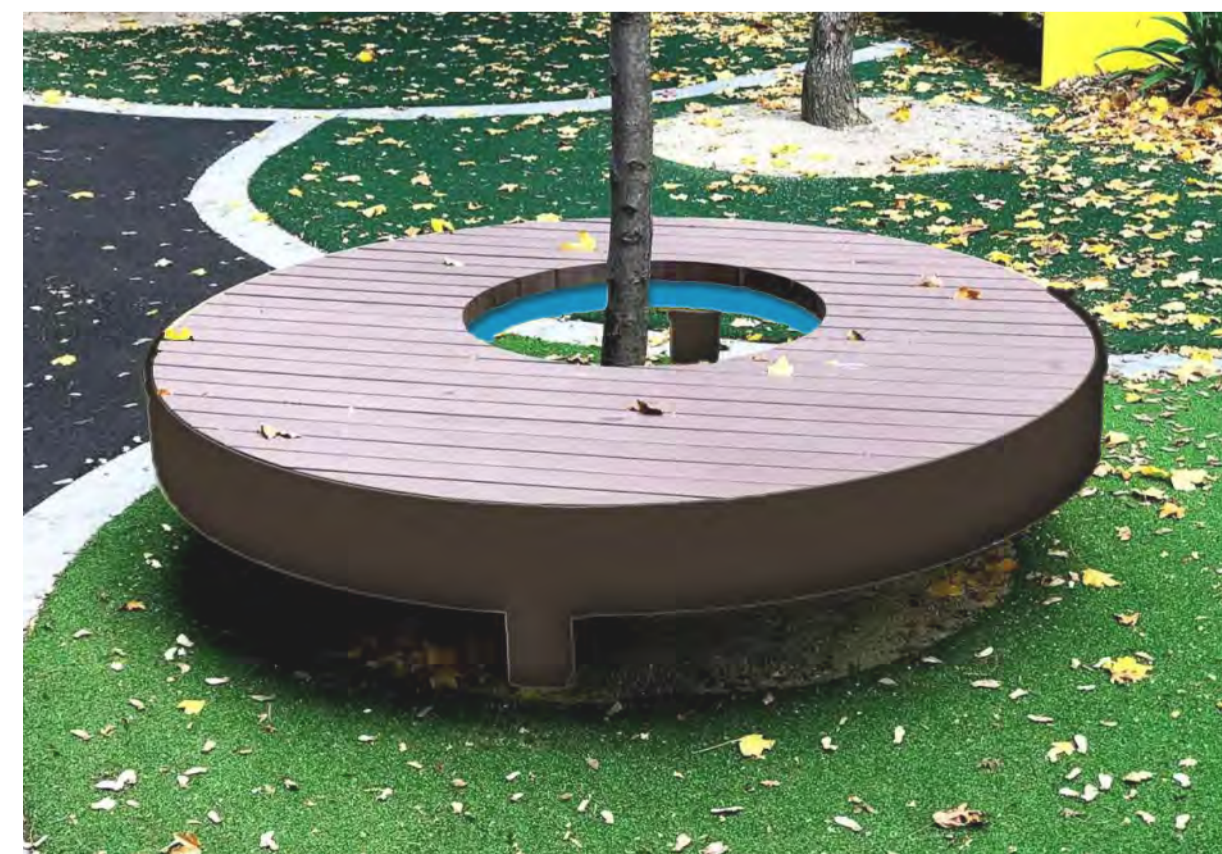
Timber podium seat with shading from central tree