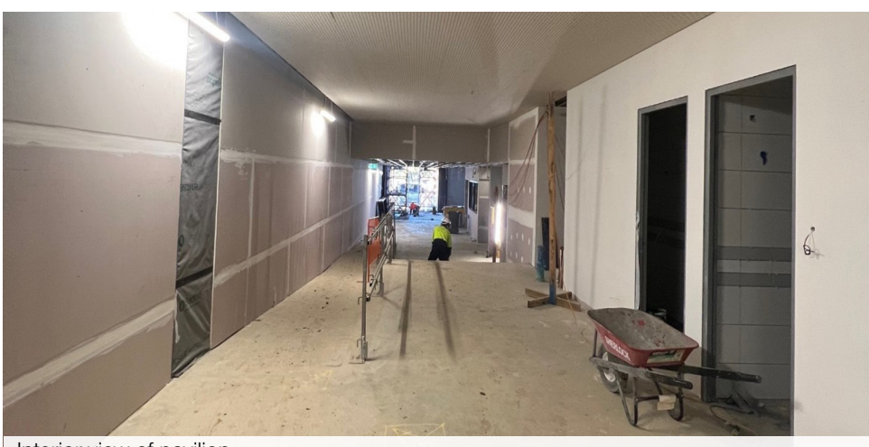
Interior view of pavilion