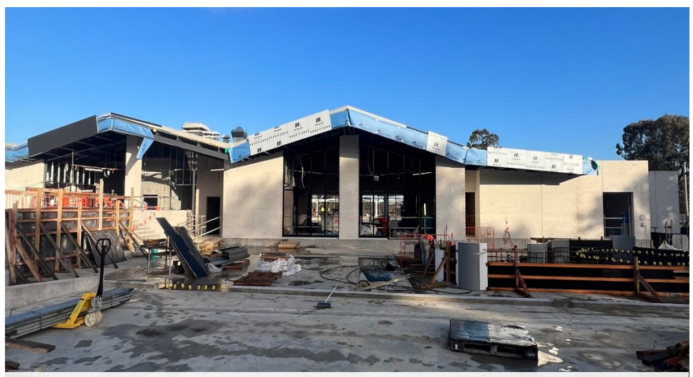
Exterior view of sports courts

Percy Treyvaud Memorial Park, Chadstone Road, Malvern East.