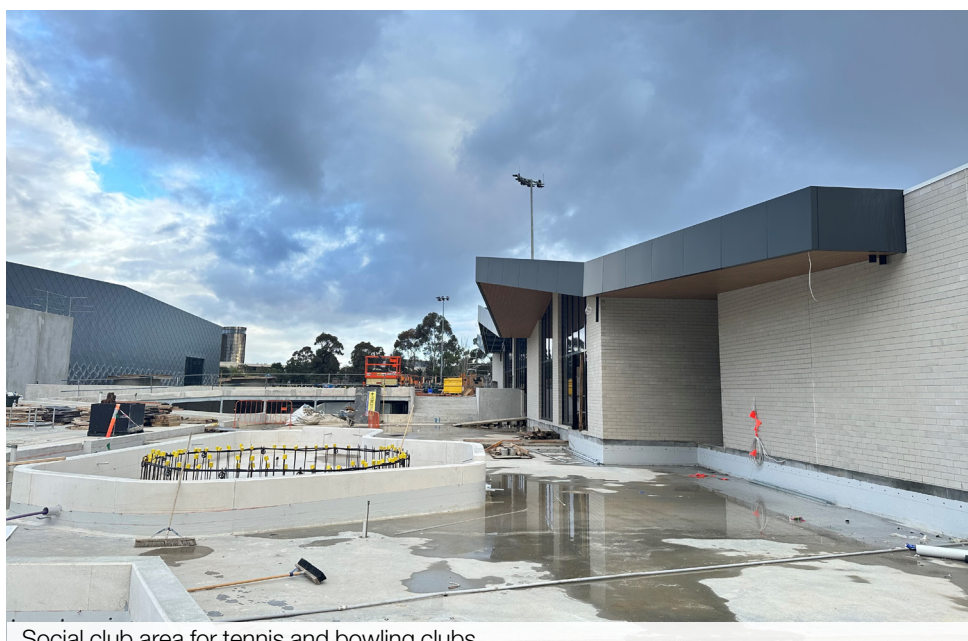
Social club area for tennis and bowling clubs

Walk along the north side of the construction site, between Chadstone and Quentin roads, to view a gallery of artworks from Malvern Valley Primary School students. The young artists have created 240 self-portraits depicting themselves enjoying their favourite sport.