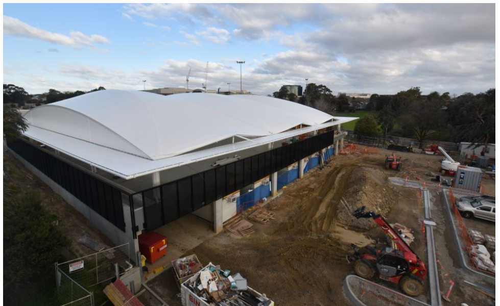
Now: overlooking the new canopied bowling green