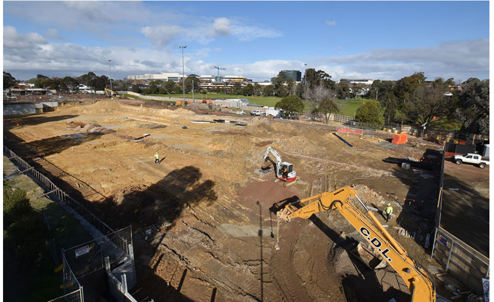
Then: preparing the site in July 2022