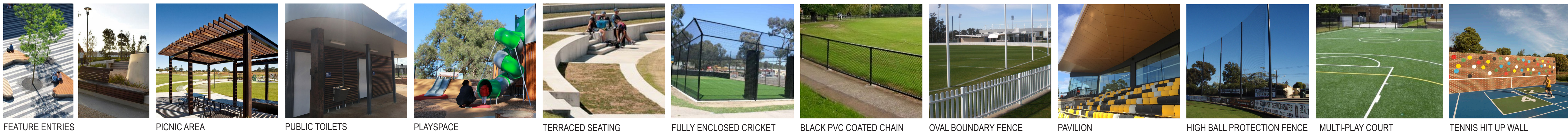
FEATURE ENTRIES PICNIC AREA PUBLIC TOILETS PLAYSACE TERRACED SEATING FULLY ENCLOSED CRICKET PRACTICE FACILITY BLACK PVC COATED CHAIN MESH FENCING TO OVAL OVAL BOUNDARY FENCE PAVILION HIGH BALL PROTECTION FENCE MULTI-PLAY COURT TENNIS HIT UP WALL